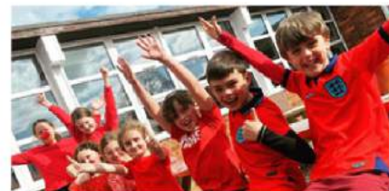
Raised £475 for Comic Relief!