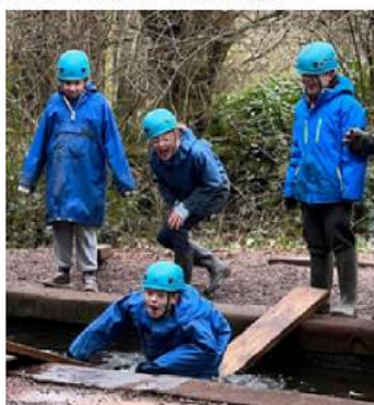
Year 5 made a 'splash' at Standon Bowers!