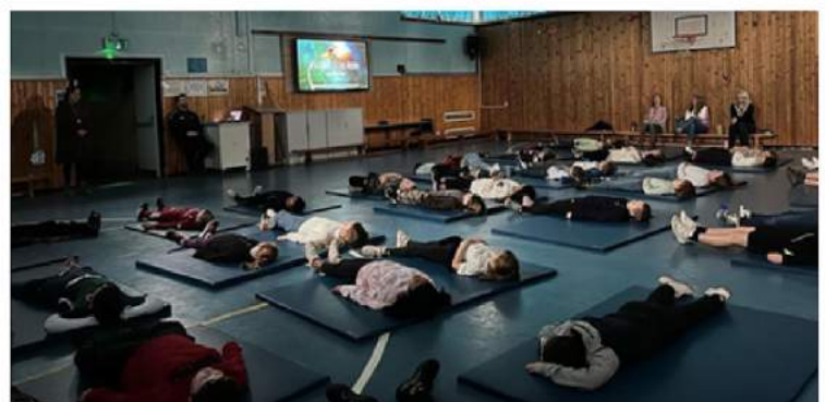
We took some time for our wellbeing in our PSHCE morning!