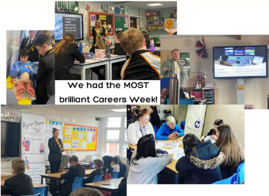
We had the MOST brilliant Careers Week!