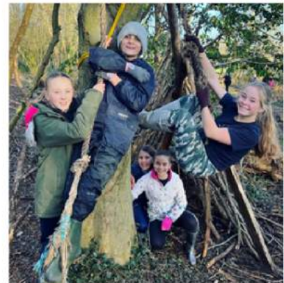
We got stuck into Forest School